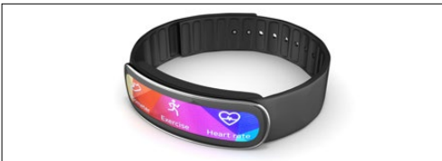
Wearables (Smart Watches, Health Monitors, AR & VR)