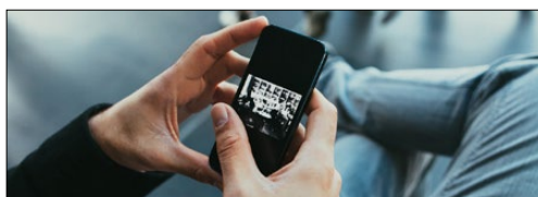
Mobile Applications, Handheld