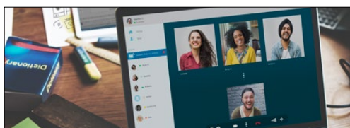
5G Networking/Telecommunications Communication Modules (WiFi Routers and Mesh Devices)