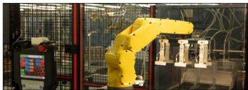
Industrial IoT / Robotics & Factory Automation