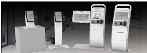
Medical diagnostic equipment