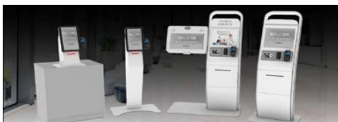
Medical diagnostic equipment