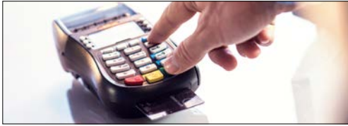
Point of sale (POS)