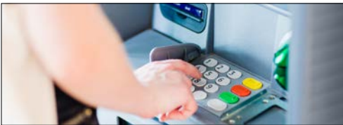
Kiosk (Charging Stations, Key Makers, ATM)