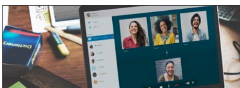
5G Networking/Telecommunications Communication Modules (WiFi Routers and Mesh Devices)