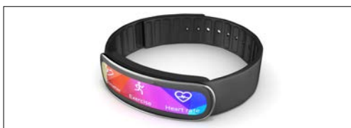
Wearables (Smart Watches, Health Monitors, AR & VR)