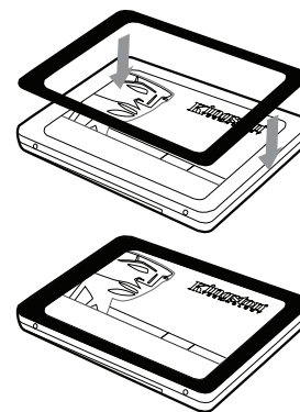
SSDNow with 2.5mm Adhesive Adapter